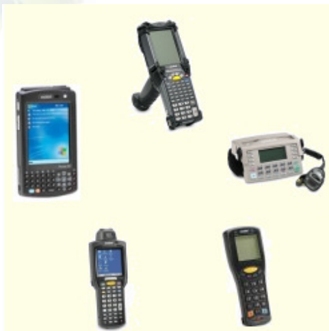
Data collectors with bar code scanners